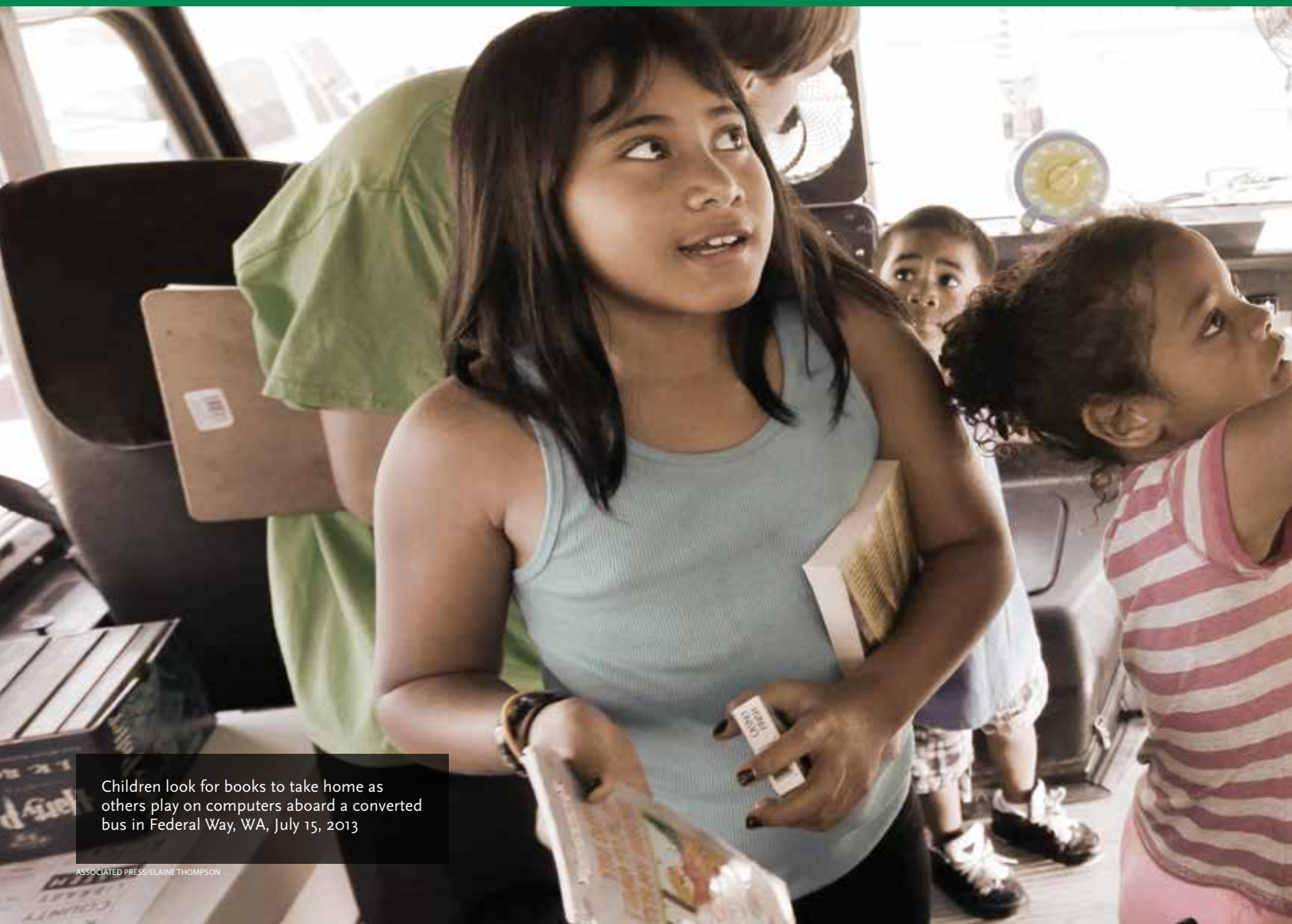
Children look for books to take home as others play on computers aboard a converted bus in Federal Way, WA, July 15, 2013