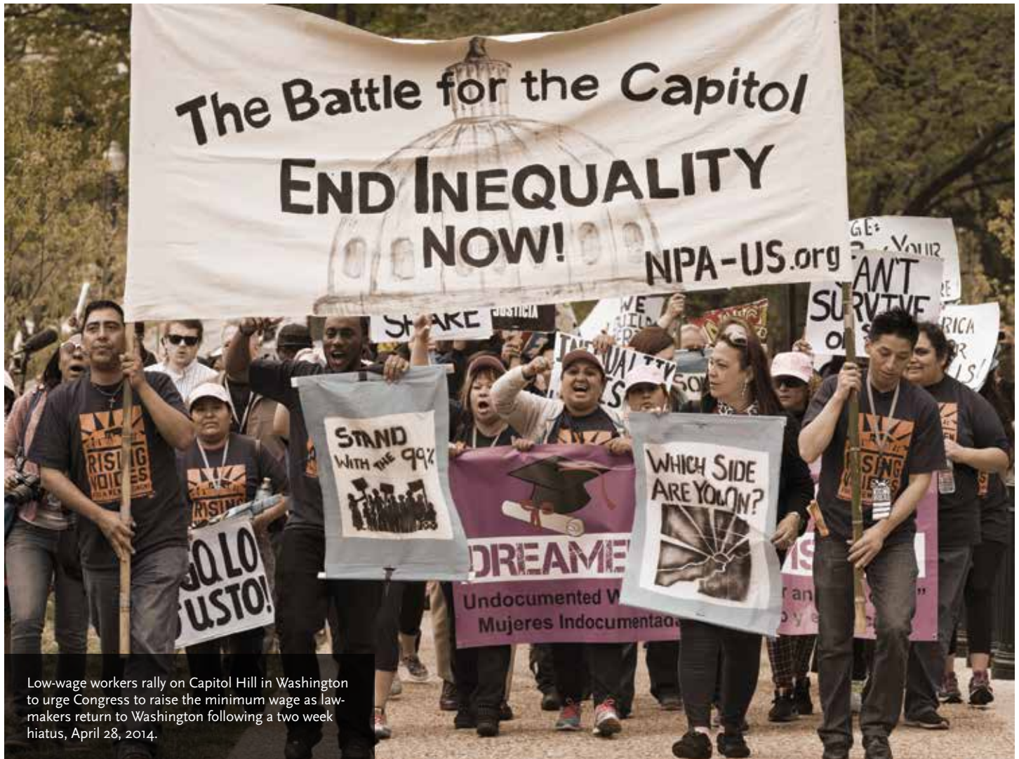
Low-wage workers rally on Capitol Hill in Washington to urge Congress to raise the minimum wage as lawmakers return to Washington following a two week hiatus, April 28, 2014.